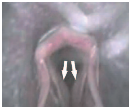
Fig. 2 Axial deviation of both caudal plicae vocales (ADPV, arrows) during inspiration. | Axiale Deviation beider kaudalen Plicae vocales (ADPV, Pfeile) während der Inspiration